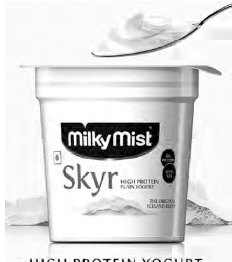
HIGH PROTEIN YOGURT

portfolio of Yogurt will have normal/regular fruit based yogurt with 3% protein; Greek yogurt with 6% to 7% protein and Skyr with 11% protein content encompassing all ranges where the consumers can buy according to their need and preference.