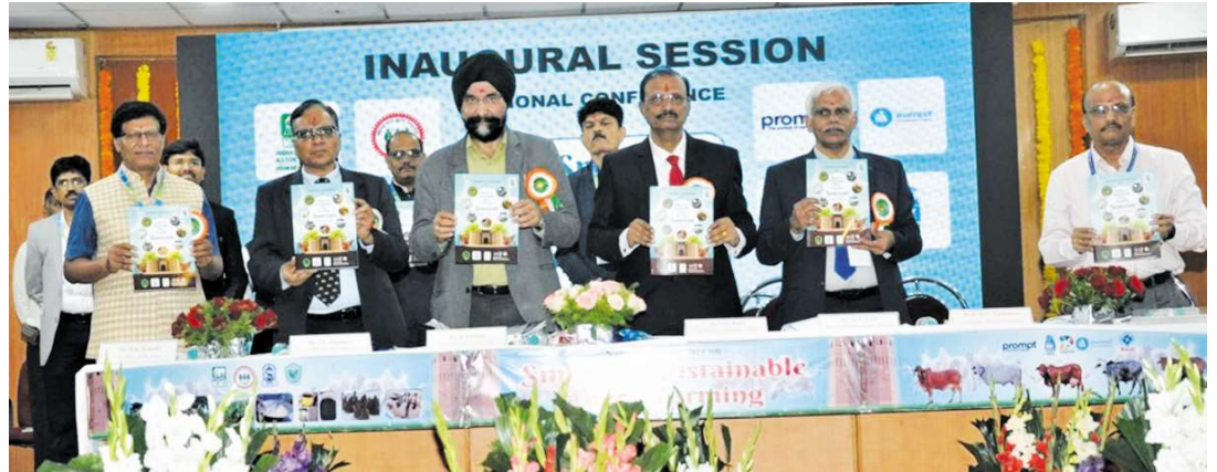
National conference on " Smart and Sustainable Dairy Farming " was organized by Indian Dairy Association (West Zone) in association with Indigenous Cattle Research cum Training Centre (ICRTC) of Mahatma Phule Krishi Vidyapeeth, Rahuri (MPKV) and BAIF Development Research Foundation at Agriculture College, Pune during January 5-6, 2024. The program was attended by about 300 delegates