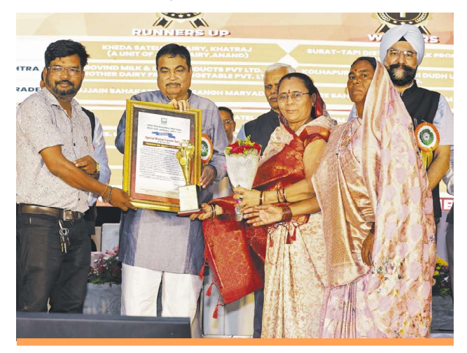
Hon'ble Minister and other dignitaries presenting Special Women Farmer Award

Shri Nitin Gadkari in his inaugural speech indicated that 12-14% contribution in the country's GDP is from agricultural and affiliated sectors, including 65% population. To increase this contribution, he motivated the congregation to increase efficiency in agriculture and related sectors with appropriate technology and future planning based on water, land, forest and animals. Hon'ble Minister praised the work done by NDDB and mother dairy done in the Vidarbha-Marathwada region to increase the milk production. He emphasized on technological transfer, increased productivity, increased processing, and future planning at grassroot level. He also praised the work of MAFSU under the leadership of Vice Chancellor, Dr. N.V. Patil and asked to work