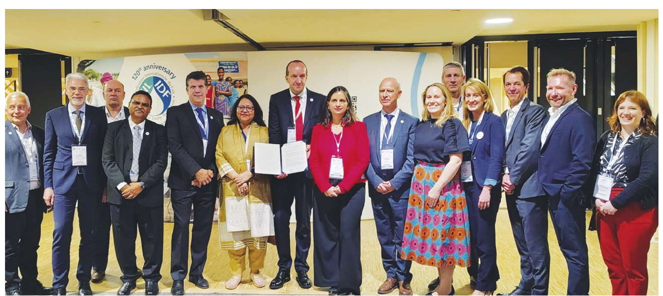
Secretary (AH&D), Ministry of FAHD, Gol; Chairman, NDDB with Newly Elected President-IDF & Former President-IDF; FAO Official; and Other IDF National Committee Members

She explained the importance of public-private partnerships, research, and ensuring that farmers are engaged from the beginning to avoid policy failures. She also mentioned the significant role of international organisations like IDF and FAO that are crucial players in supporting farmers and creating markets.