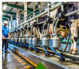
Dairy Farming Technologies & Equipment