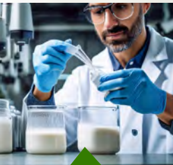
Quality Control & Lab Equipment