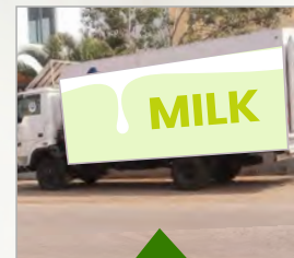
Cold Chain & Logistics Solutions