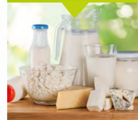
Ingredients & Additives